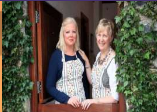
Anger Cl nger Co