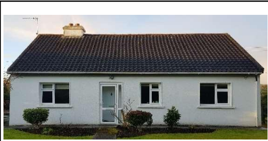
Oughterard, County Galway