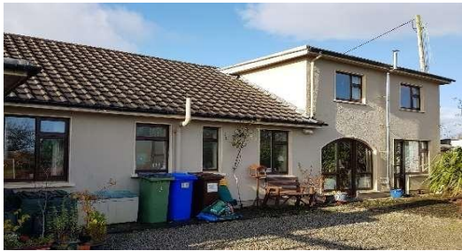
Barna, County Galway