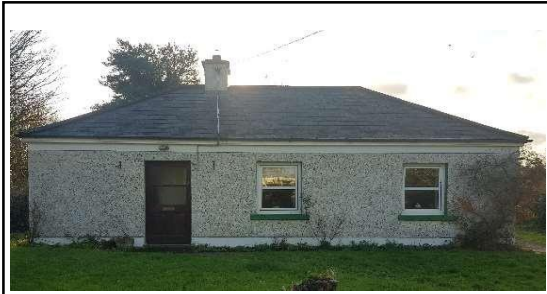
Lawrencetown, County Galway